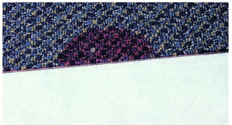
Guardian FB keeps spills on top