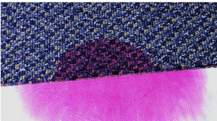
Spills soak through ordinary carpet onto subfloor